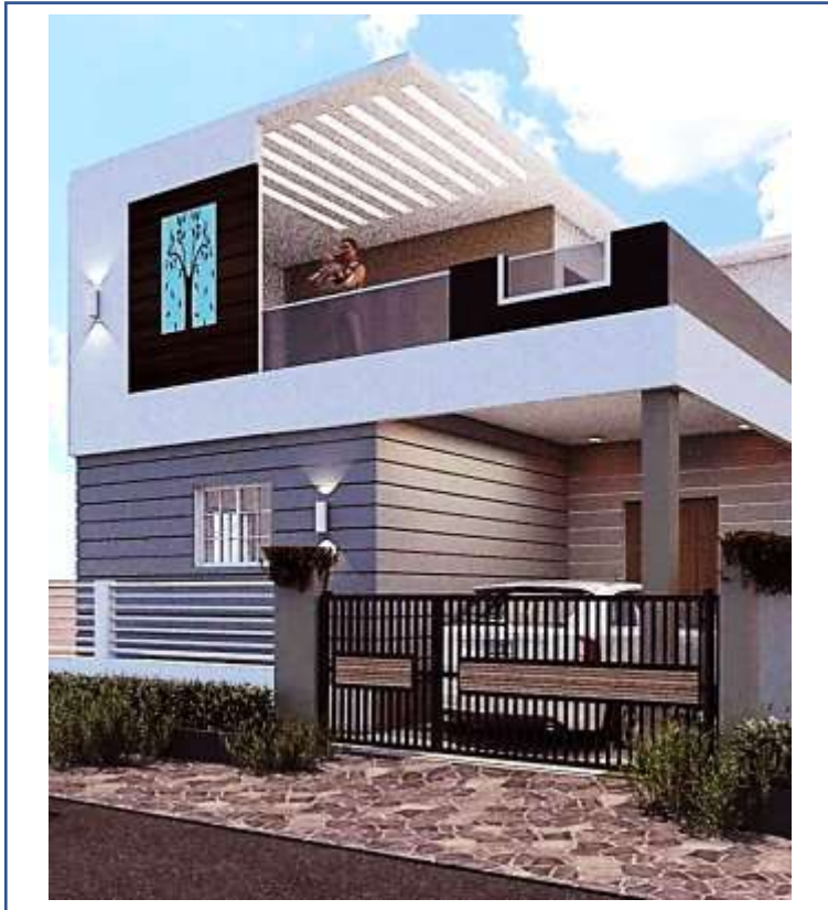
SAMPLE ELEVATION DESIGN 3BHK