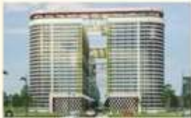
Gate Way IT Park, Kandlkoya