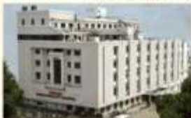
Yashoda Nursing Hospital