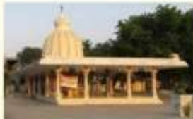
ISKON Temple, Nuthankal