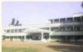
Nazareth Grammar School