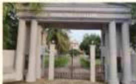
Bharat Bible College