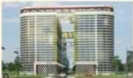
Gate Way IT Park, Kandlkoya