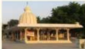
ISKON Temple, Nulhankal