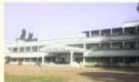
Nazareth Grammar School