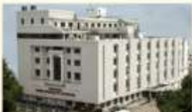
Yashoda Nursing Hospital