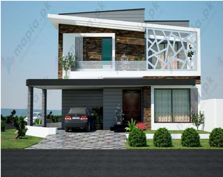
PREMIUM CUSTOM VILLAS