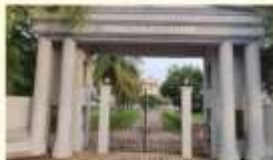
Bharat Bible College